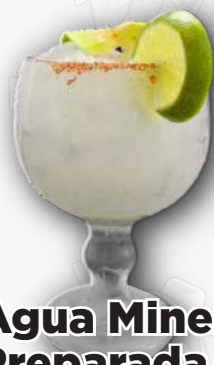
Agua Mineral Preparada 10.99

Thirsty? Have an Iced mineral water with apple soda, a pinch of salt and lime juice.