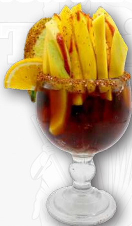
Sangría Preparada 13.99

Iced spiced sangria, salt and lime juice decorated with mango and cucumber.