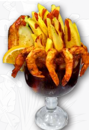
Sangría Super 18.99

Iced spiced sangria, salt and lime juice decorated with mango and cucumber.